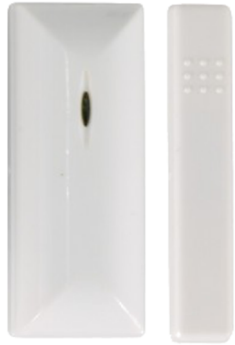
MD-210R Wireless Door Contact

Transmitting Range: Inset 150m Working Voltage: 3V lithium battery Working Temperature: -10°C~50°C Dimension: 81x 32x 25mm Magnetic: 74.5x 13.5 x 18.8mm