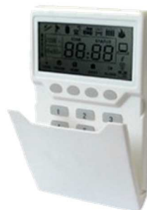
PB-500R Wireless Keypad

Operating Voltage: 12-14 VDC Standby Current: 350mA Backup Battery: 9-12V 800mA Working Temperature: -30°C ~+80°C Dimensions: 255 x 148 x 64mm