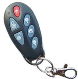
PB-403R Wireless Remote Control

Power Voltage: 6 V DC Current Static: 20Ua-40Ua, 20mA Working Range: Max. 100m Radiation of Sensor: Max. 4 kBq Built in Siren: 95dB/1m