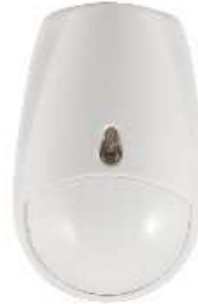
MC-335R Wireless Motion Detector

Transmitting Range: Inset 150m Working Voltage: 3V lithium battery Working Temperature: -10°C~50°C Dimension: 81x 32x 25mm Magnetic: 74.5x 13.5 x 18.8mm