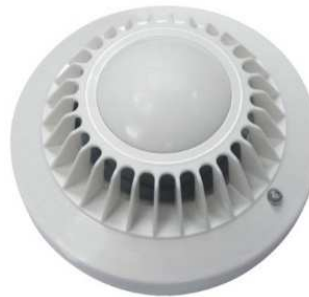
MD-2100R Wireless Smoke Detector

Detect Angle: 20° Detect Distance: 6m/25 Transmit Distance: 150m Input Voltage: 3VDC (2*1.5V)