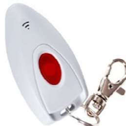
PB-201R Wireless Emergency Button

Detecting Range: 100m Power Voltage: 5.8V-7V. CR2032*2 Temperature: -10°C ~ 50°C Size: 66.5 x 31.5x 10.5mm Weight: 22g