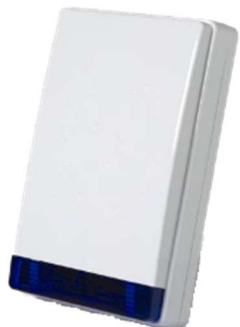
MCS-307 PVC Outdoor Siren

Effective Area: 100m Power Voltage: 11.5-12.5V, 7A battery Working Temperature: 10°C-50°C Size: 65x34x17.5mm Weight: 30g