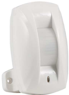
DM-448R DMT Wireless Curtain Detector

Detection Range: 9m (25°C) Transmit Range: 120m-150m Power Voltage: 3V DC lithium battery Static Current: <9uA Max Coverage Area: 9m*12m /90°